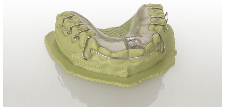
You can continue working with the model as usual without any post-processing