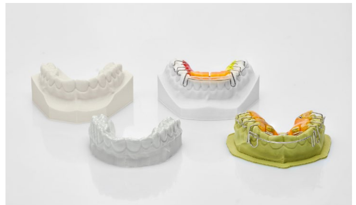
Designed for complete model fabrication for orthodontic applications