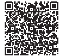
Rotary polishing: clinically based