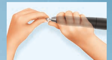
K-ERGOgrip (above): Ergonomic holding position, gentle on the wrist. No "bending" as with other handpieces (example below)